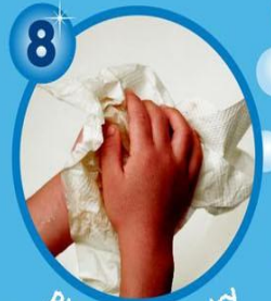
Rinse and wipe dry