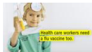
The Flu Ends with U - Healthcare Workers