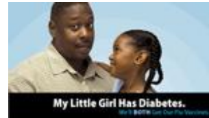
Diabetes and flu