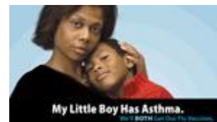
Asthma and flu