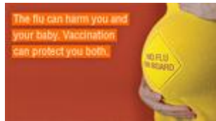
The Flu Ends with U - Pregnant Women