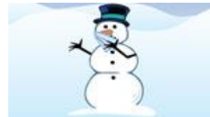
Deck Yourself for Flu