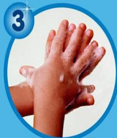
Back of hands