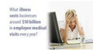
Businesses and Flu Vaccination