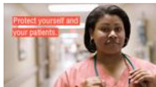
The Flu Ends with U - Health Professionals