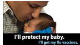
Infants and flu