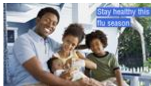
The Flu Ends with U - Families