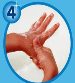
Base of thumbs