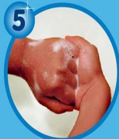
Back of fingers