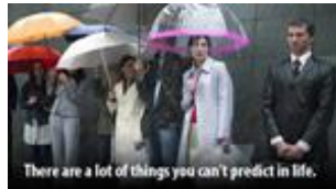
Employees and Flu Vaccination