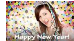
Fight the Flu in the New Year