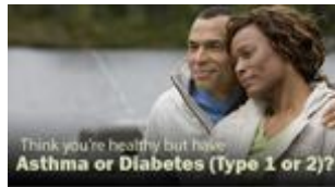
High Risk for Flu