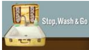
Healthy for Flu Season