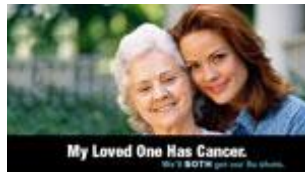
Protect Yourself and Loved Ones