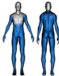
Preferred Target Areas

Recent guidelines from TASER International (dated 30 September, 2009) have redefined the targeting areas as to avoid the head and neck and if possible the chest. As such, the areas located below in blue are the preferred target areas while the back is the optimal preferred area when practical. Maximum clothing penetration is 2 inches total or 1 inch per probe.