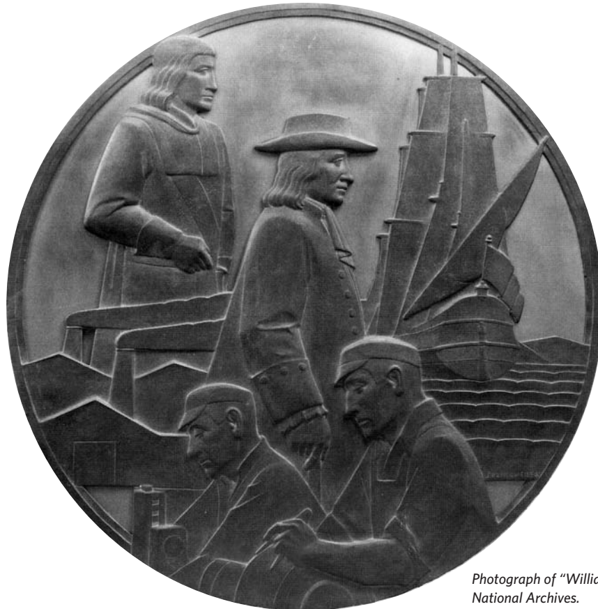
Photograph of "William Penn" courtesy of the National Archives.

Combining images of the past and present was a popular compositional scheme in New Deal art. This aluminum bas relief depicts Williams Penn, Chester's founder, as well as 1930s workers. Penn sailed from England and arrived in Chester, then known as Upland, in 1682. Penn, in his familiar Quaker dress, is placed prominently in the center of the medallion-like panel and faces Welcome, the ship that brought him to the New World. Below Penn are two 20th century machinists and factories. The figure in the right foreground is using a lathe, measuring with calipers.